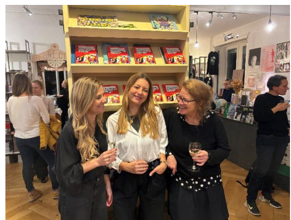
Vernissage "Revisioning Democracy and Women's Suffrage", Paranoia City, Zürich