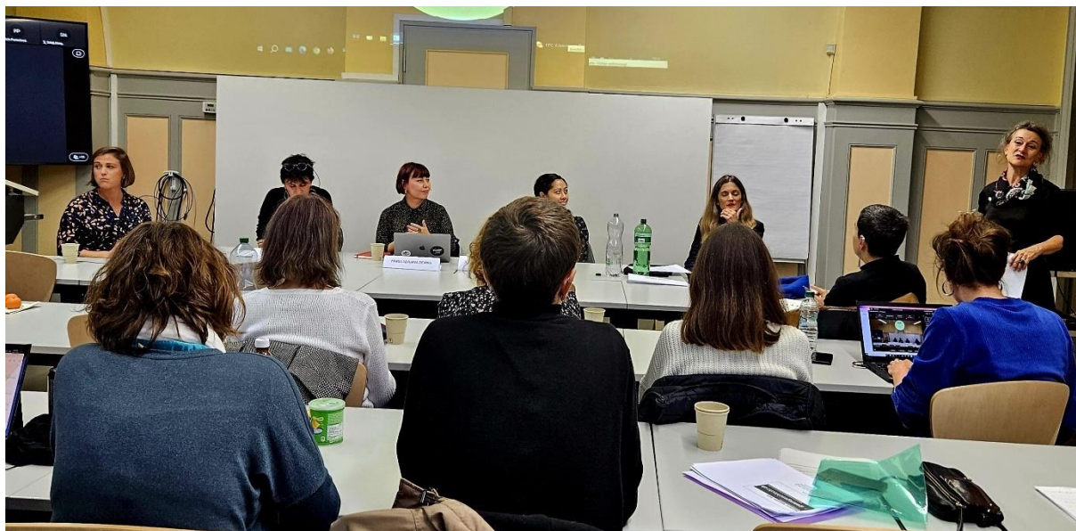
SAGS Roundtable "Feminist Approaches to Political Violence," University of Neuchâtel

the world is witnessing some of the most unfathomable displays of state-led violence in modern history, what tools do our feminisms hold for stronger alliance building?