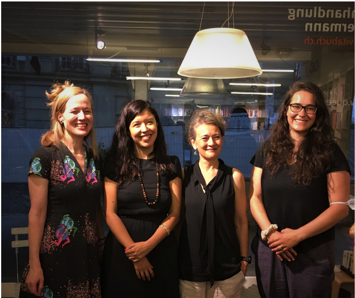
Vernissage of the book "Violent Times, Rising Resistance"